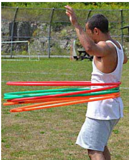
Slipping, Sliding, and Hooping it up!

including a slip and slide (the kids absolutely loved this—mud and all), a wading pool with marbles, and “Dunk Tank!” Lots of events and fun for all!